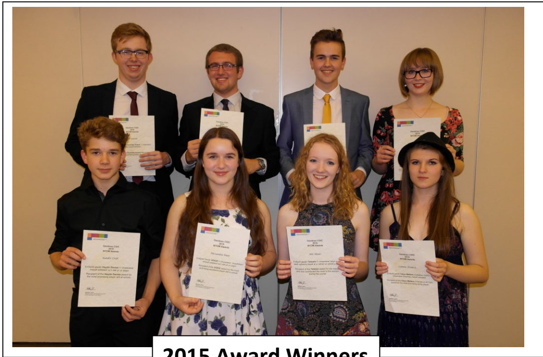
2015 Award Winners