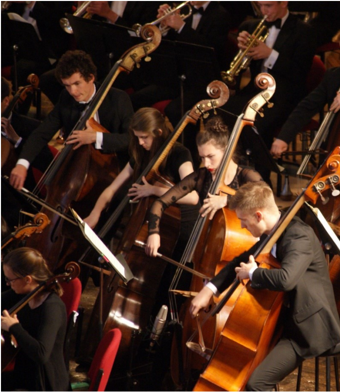
The 2015 bass section in full flight!