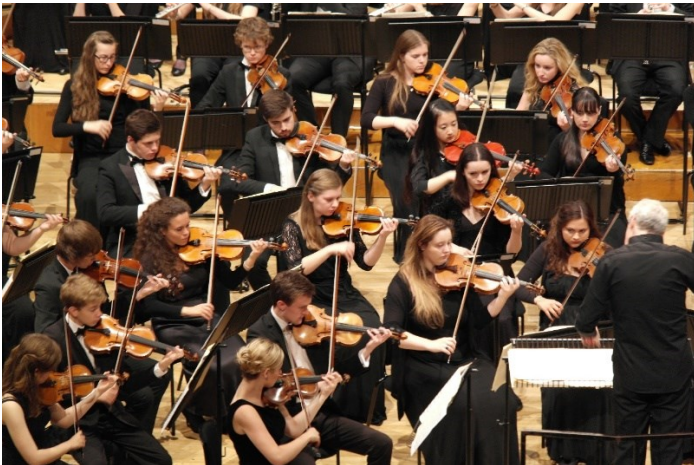
First and second violins with conductor Paul Daniel