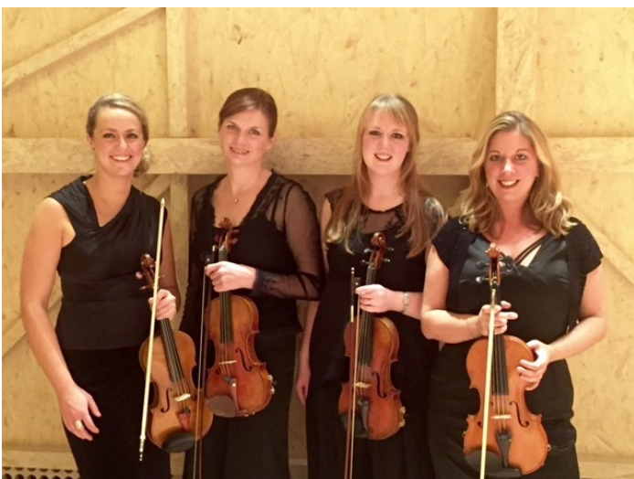
Four former NYOW leaders