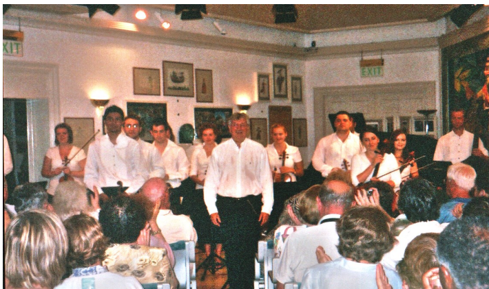
NYOW in the Recital Room or the Walton Museum, La Mortella, Ischia