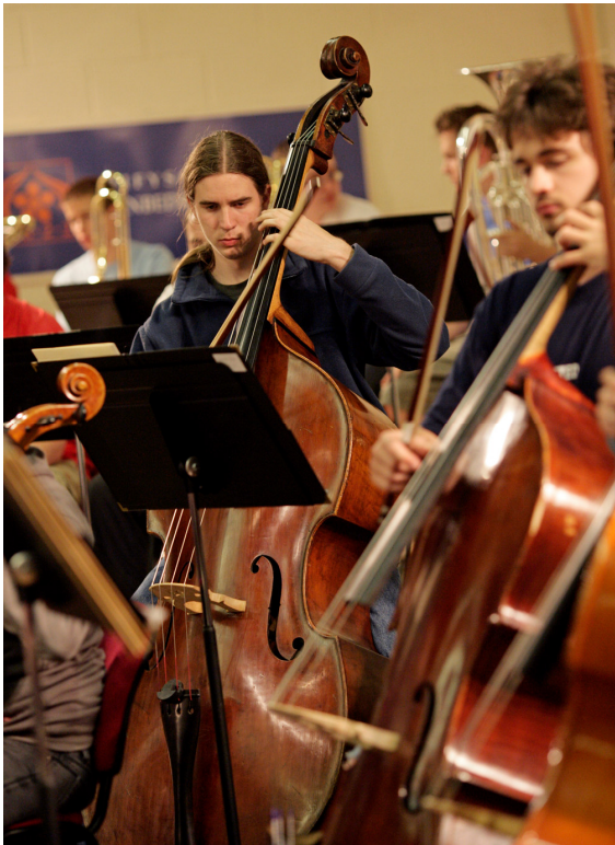
Members of the bass section, left and flutes and oboes, right