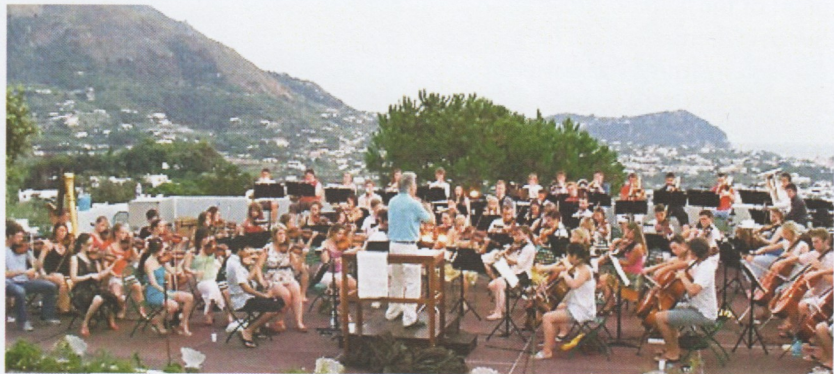
NYOW in Ischia