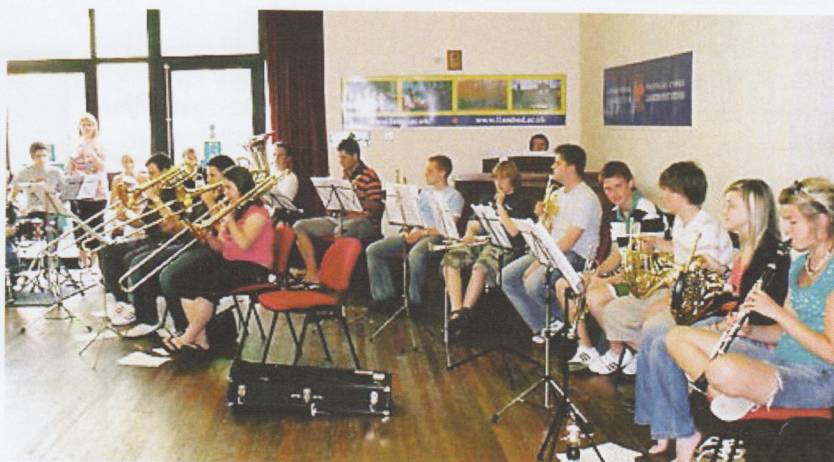
Rehearsal at Lampeter

Our concert tour started with a free lunchtime concert in Lampeter, attended by members of the local community, staff from the University and a number of parents. It was a great concert and a nice way to say thank you to everyone who makes us feel so welcome year after year. As the orchestra truck made its way up to Bangor ready for the next day's concert, the students turned their hands to performance of a slightly different kind with the annual Cabaret night. It was a fantastic evening's entertainment and not only showed how hugely talented these young people are, but showed the camaraderie and