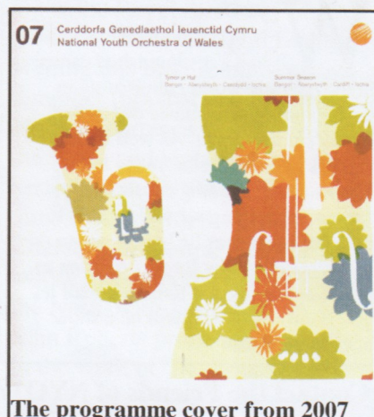
The programme cover from 2007

The 1953 programme offered works by Humperdinck, Mozart, Dvorak, Daniel Jones, Weber and Bizet.